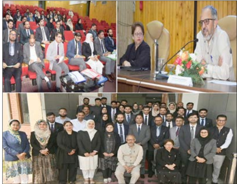
one-day workshop on "Soft Skill Development, Stress Management, Time Management, and Court Management Techniques" at its Srinagar campus.

The event witnessed enthusiastic participation from judicial officers across the region.