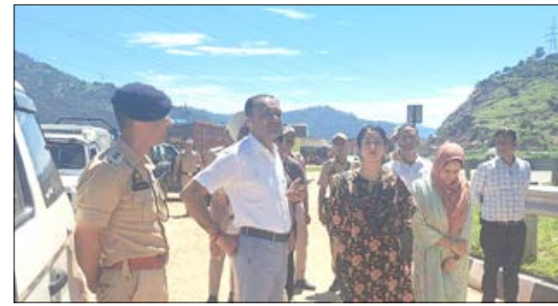
of the Jammu-Srinagar National Highway NH-44 at Thard to take stock of the ongoing restoration works.

He emphasized that every possible effort shall be made to restore NH-44, other critical roads and provide necessary relief to the affected popu-