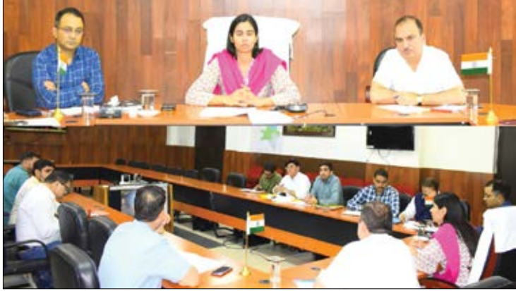
across the district. She instructed the Executive Engineers of PWD and PMGSY to smooth traffic movement. Further, the DC also reviewed crop

Reasi also assessed the status of road restoration works to ensure connectivity accelerate repair and landslide clearance work on roads identified by SDMs to restore