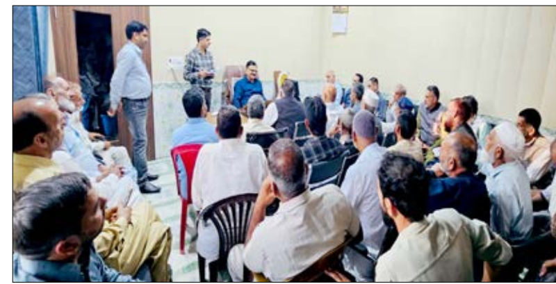
FE News Network