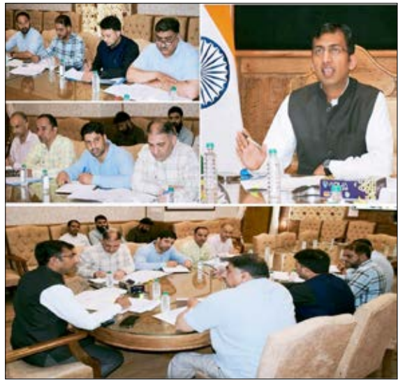
FE News Network