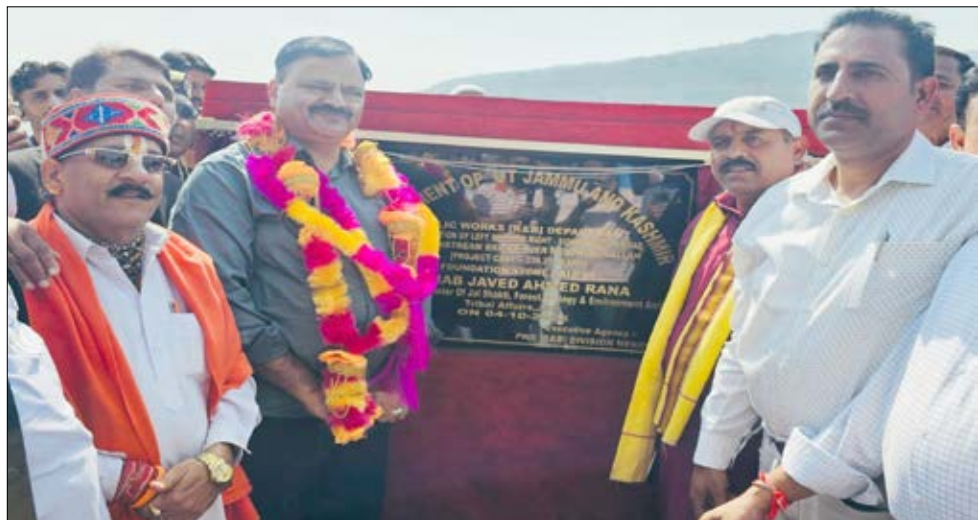
FE News Network

Also reviews developmental scenario of Mendhar Constituency